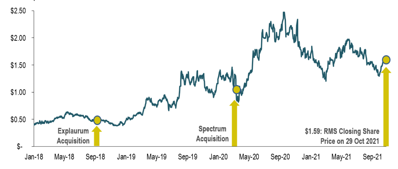
Figure 2: Ramelius recent acquisitions<sup>5</sup> and share price performance

Ramelius has successfully undertaken the acquisitions of Explaurum Limited and Spectrum Metals Limited in recent years (each via takeover offer), providing a mix of cash and shares to target shareholders in each case. As demonstrated in Figure 2, the returns realised by target shareholders who received Ramelius shares and have retained those shares, in each case, have been outstanding, with all Ramelius shareholders benefiting from the value creation achieved by the company since undertaking those acquisitions.