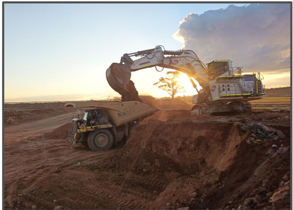
Figure 1: First ore from North Pit at Tampia

The project has commenced on schedule and is on track to despatch the first road train of high grade ore to the Edna May processing facility in early July 2021.