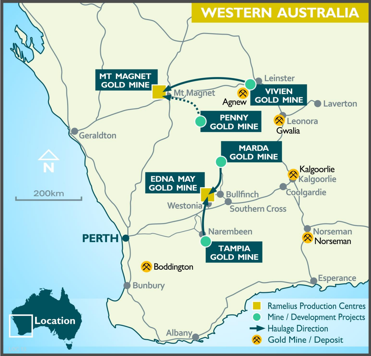
Figure 3: Ramelius' Production Centre and Development Project locations

Ore from the high-grade Vivien underground mine, located near Leinster, is trucked to the Mt Magnet processing plant where it is blended with ore from both underground and open pit sources. The Edna May operation currently processes ore from its underground and open pit operations as well as hauled ore from the Marda gold mine.