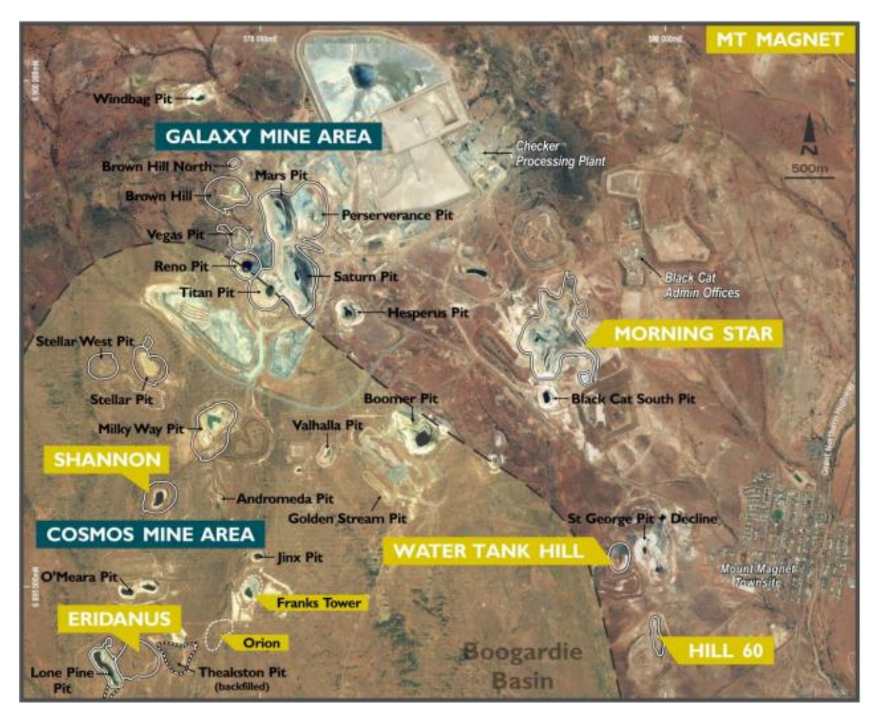
Figure 3: Mt Magnet key mining & exploration areas