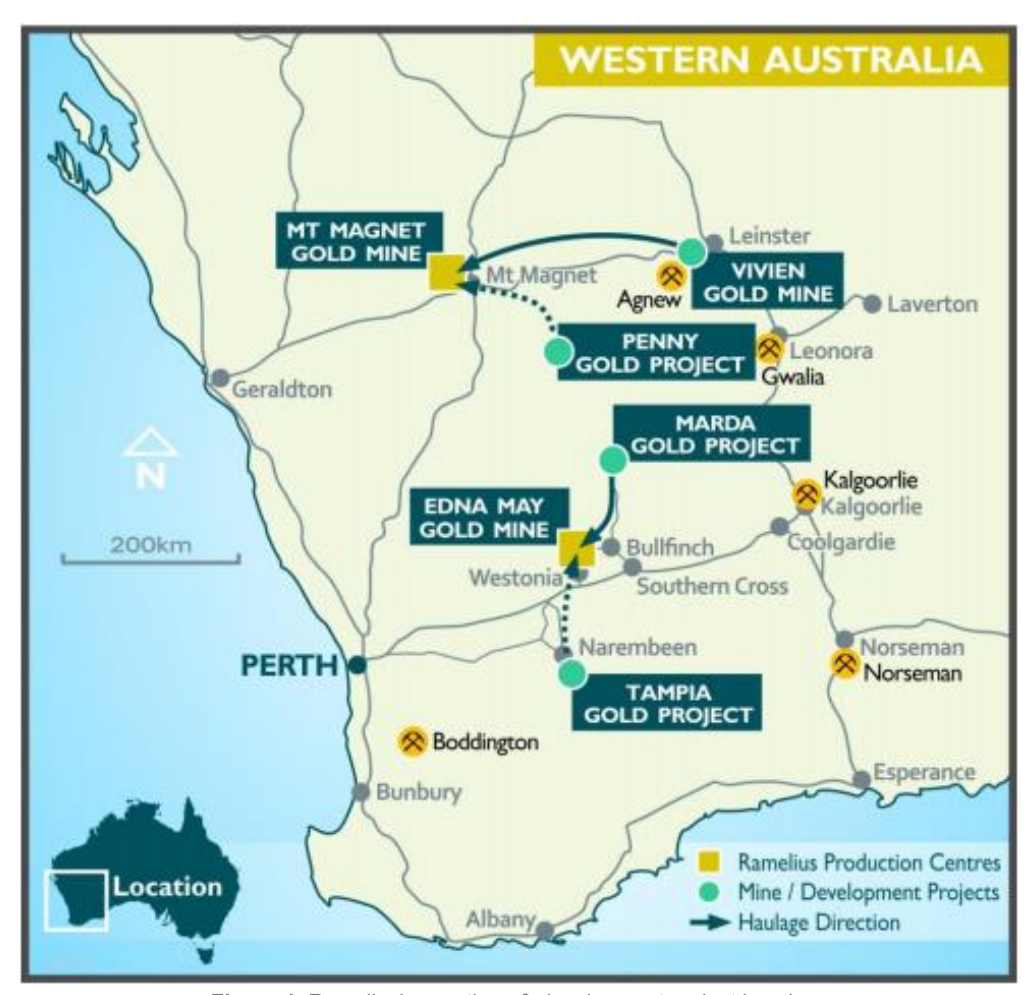
Figure 1: Ramelius' operations & development project locations

Ramelius is an established ASX 200 gold production and exploration company. Following record production of 230,426 ounces in the 2020 financial year Ramelius has set guidance for the 2021 financial year at 260,000 – 280,000 ounces which, if achieved, will be another record year for the company. Furthermore, a life of mine plan was released on 30 June 2020 which detailed annual gold production averaging over 250,000 ounces out to the 2025 financial year. This represents a 25% increase in the average annual production and an extension of two years on the prior year life of mine plan. Total production over the life of mine plan was 1.45M oz.