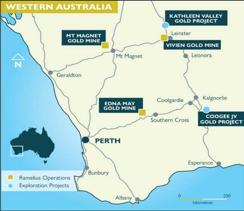
Figure 2: Ramelius' Operations & Development Project Locations

The Edna May operation, purchased from Evolution Mining Limited in October 2017, is currently a single open pit operation feeding an adjacent processing plant.