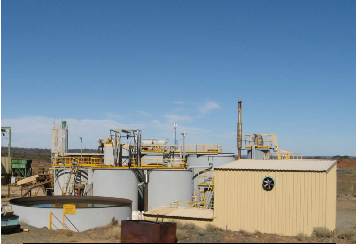
BURBANKS PROCESSING FACILITY NEAR COOLGARDIE WA