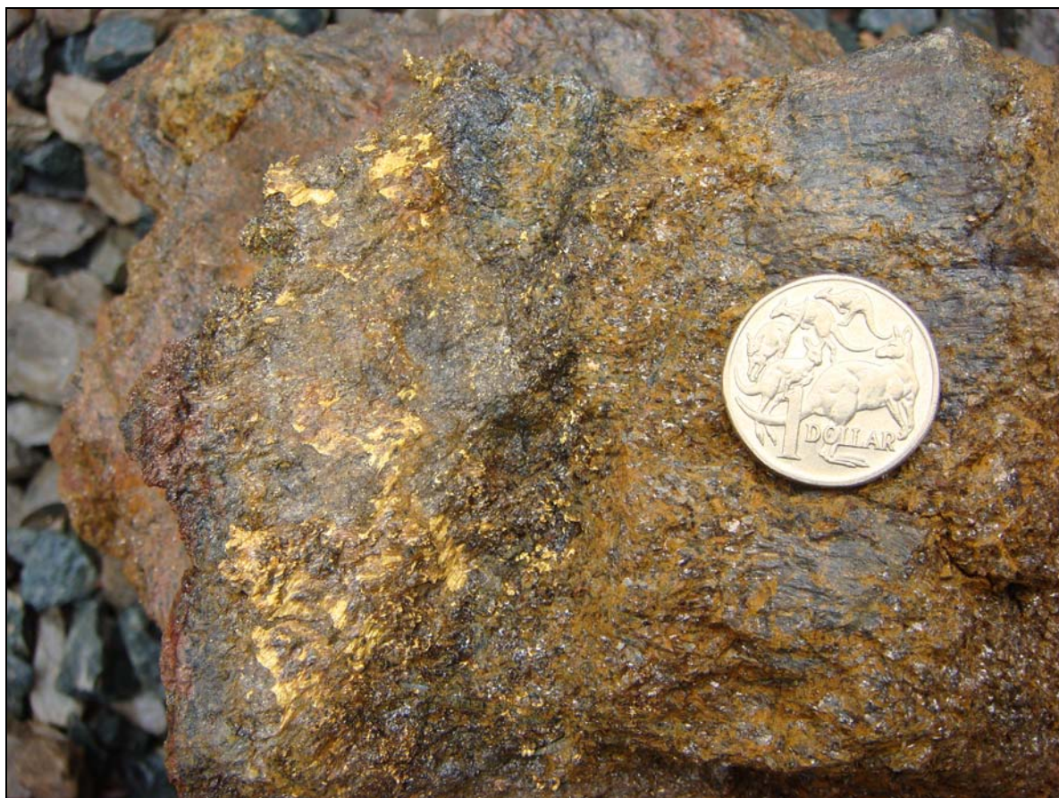
Figure 3 – High Grade Ore at 305mRL